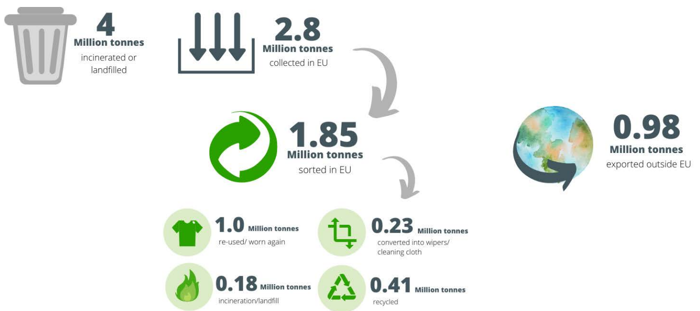
Fig. estimated volumes of discarded textiles

From an environmental and economic point of view, it is a loss to simply ship abroad or incinerate more than 4 mln tons of potential raw materials.